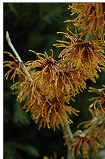
Jelena Witchhazel flowers

Jelena Witchhazel is recommended for the following landscape applications;