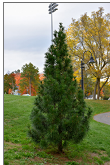
Wintergreen Umbrella Pine