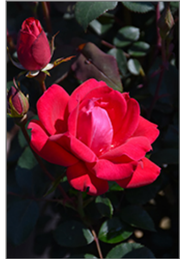
Double Knock Out Rose flowers

Double Knock Out Rose is recommended for the following landscape applications;