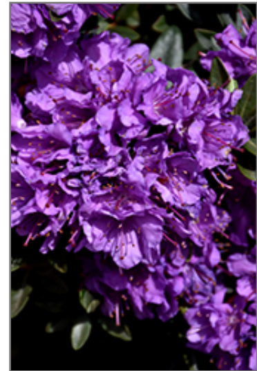
Purple Gem Rhododendron flowers