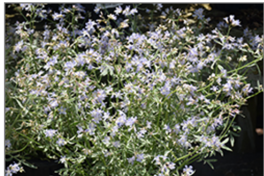
Touch Of Class Jacob's Ladder flowers