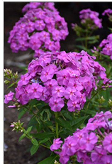
Flame Lilac Garden Phlox flowers

Flame Lilac Garden Phlox is recommended for the following landscape applications;