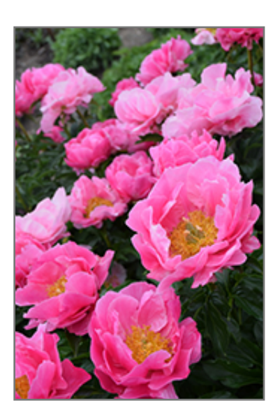
Paula Fay Peony flowers

- DiseasePaula Fay Peony is recommended for the following landscape applications;