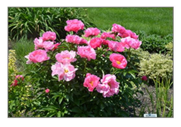
Paula Fay Peony in bloom

BRUNSWICK 422 Bath Road Brunswick, ME 04011 1-800-339-8111 207-442-8111