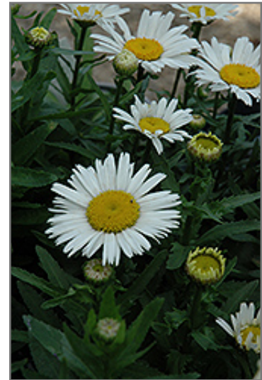
Snow Lady Shasta Daisy flowers

Snow Lady Shasta Daisy is recommended for the following landscape applications;