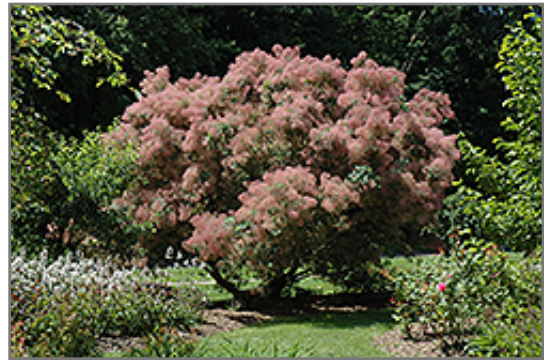
Grace Smokebush in bloom

Grace Smokebush is recommended for the following landscape applications;