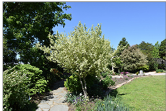
Variegated Cornelian Cherry Dogwood

BRUNSWICK 422 Bath Road Brunswick, ME 04011 1-800-339-8111 207-442-8111