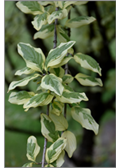
Variegated Cornelian Cherry Dogwood foliage

Variegated Cornelian Cherry Dogwood is recommended for the following landscape applications;