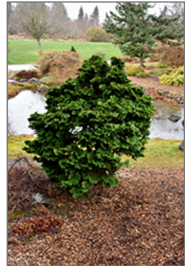
Dwarf Hinoki Falsecypress