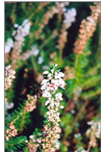
Scotch Heather flowers

BRUNSWICK 422 Bath Road Brunswick, ME 04011 1-800-339-8111 207-442-8111