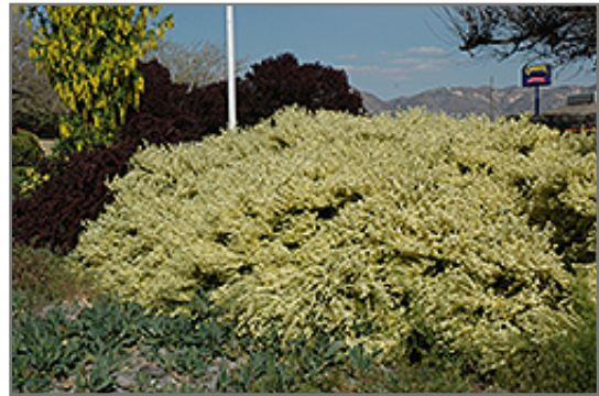
Moonlight Scotch Broom in bloom