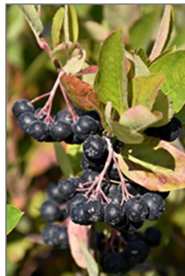
Viking Chokeberry fruit

This shrub should only be grown in full sunlight. It is an amazingly adaptable plant, tolerating both dry conditions and even some standing water. It is not particular as to soil type or pH, and is able to handle environmental salt. It is somewhat tolerant of urban pollution. This particular variety is an interspecific hybrid.