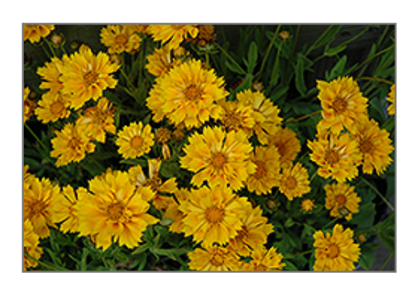
Jethro Tull Tickseed in bloom

Splendid fluted petals with cheery, daisy-like yellow flowers and a central gold disk; tolerant of pests and drier soils; thriving in sandy and rocky soils; coreopsis needs good drainage