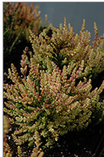
Spring Torch Heather foliage

BRUNSWICK 422 Bath Road Brunswick, ME 04011 1-800-339-8111 207-442-8111