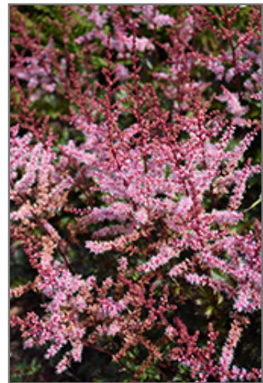
Delft Lace Astilbe flowers

This is a relatively low maintenance plant, and is best cleaned up in early spring before it resumes active growth for the season. It is a good choice for attracting butterflies to your yard, but is not particularly attractive to deer who tend to leave it alone in favor of tastier treats. It has no significant negative characteristics.