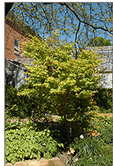
Coral Bark Japanese Maple

BRUNSWICK 422 Bath Road Brunswick, ME 04011 1-800-339-8111 207-442-8111