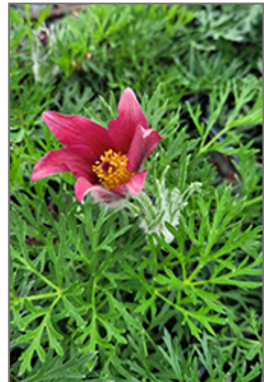
Red Pasqueflower flowers

BRUNSWICK 422 Bath Road Brunswick, ME 04011 1-800-339-8111 207-442-8111