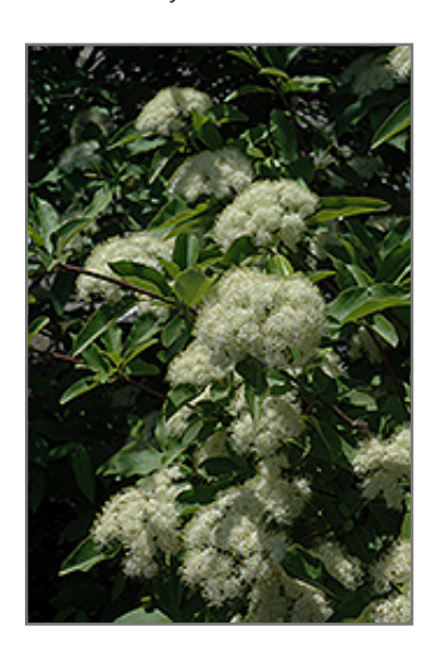
Witherod Viburnum flowers

BRUNSWICK 422 Bath Road Brunswick, ME 04011 1-800-339-8111 207-442-8111