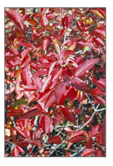
Witherod Viburnum in fall

This shrub does best in full sun to partial shade. It prefers to grow in average to moist conditions, and shouldn't be allowed to dry out. It is not particular as to soil type or pH. It is somewhat tolerant of urban pollution. This species is native to parts of North America.