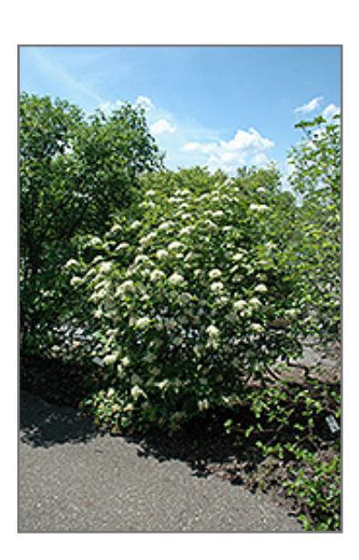
Witherod Viburnum in bloom