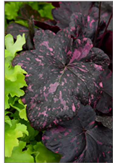
Midnight Rose Coral Bells foliage

Midnight Rose Coral Bells is recommended for the following landscape applications;