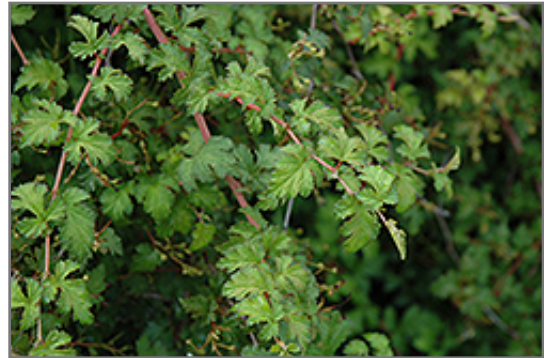
Cutleaf Stephanandra foliage

BRUNSWICK 422 Bath Road Brunswick, ME 04011 1-800-339-8111 207-442-8111