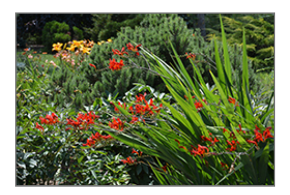
Lucifer Crocosmia in bloom

This is a relatively low maintenance plant, and should be cut back in late fall in preparation for winter. It is a good choice for attracting bees, butterflies and hummingbirds to your yard, but is not particularly attractive to deer who tend to leave it alone in favor of tastier treats. It has no significant negative characteristics.