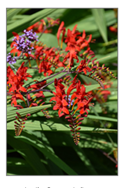
Lucifer Crocosmia flowers

Lucifer Crocosmia is an herbaceous perennial with an upright spreading habit of growth. Its medium texture blends into the garden, but can always be balanced by a couple of finer or coarser plants for an effective composition.