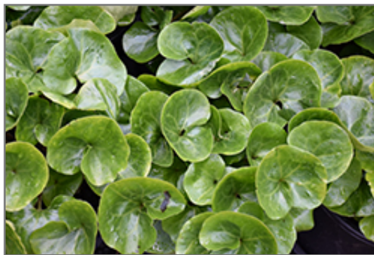
European Wild Ginger foliage

BRUNSWICK 422 Bath Road Brunswick, ME 04011 1-800-339-8111 207-442-8111