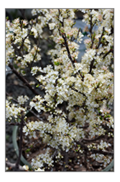
Beach Plum flowers

Beach Plum is clothed in stunning fragrant white flowers along the branches in mid spring before the leaves. It has green deciduous foliage. The pointy leaves turn an outstanding orange in the fall. The fruits are showy burgundy drupes with silvery blue overtones, which are displayed from mid to late summer.