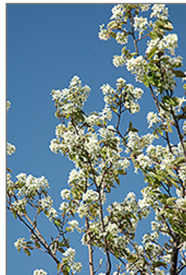
Allegheny Serviceberry flowers

BRUNSWICK 422 Bath Road Brunswick, ME 04011 1-800-339-8111 207-442-8111