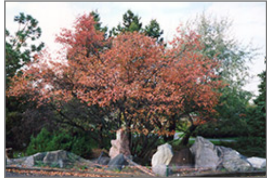
Allegheny Serviceberry in fall

This tree does best in full sun to partial shade. It prefers to grow in average to moist conditions, and shouldn't be allowed to dry out. It is not particular as to soil type or pH. It is somewhat tolerant of urban pollution. This species is native to parts of North America.