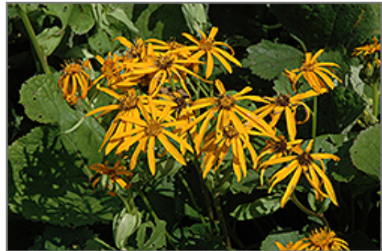
Othello Rayflower flowers