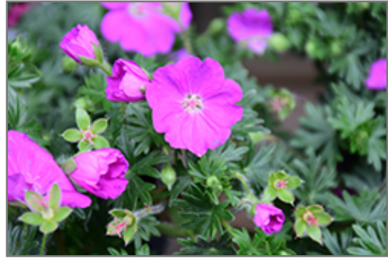
Max Frei Cranesbill flowers

Max Frei Cranesbill is a fine choice for the garden, but it is also a good selection for planting in outdoor pots and containers. It is often used as a 'filler' in the 'spiller-thriller-filler' container combination, providing a mass of flowers against which the thriller plants stand out. Note that when growing plants in outdoor containers and baskets, they may require more frequent waterings than they would in the yard or garden.