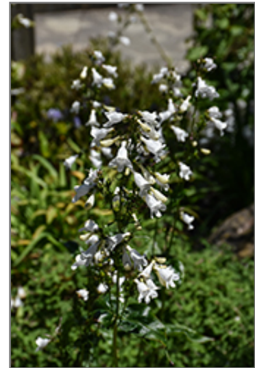
Foxglove Beardtongue flowers

Foxglove Beardtongue is recommended for the following landscape applications;