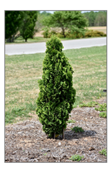
Brobeck's Tower Arborvitae