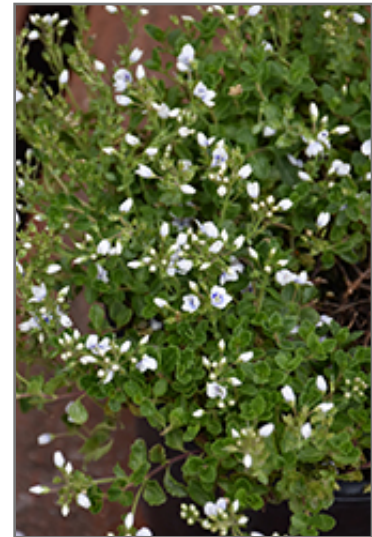
Snowmass Blue-Eyed Veronica flowers

Snowmass Blue-Eyed Veronica is recommended for the following landscape applications;