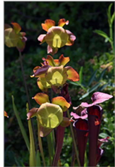
Conversation Piece Pitcher Plant flowers