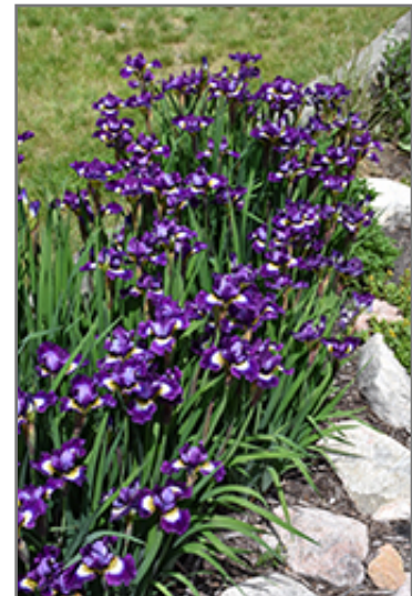
Jewelled Crown Siberian Iris in bloom Photo courtesy of NetPS Plant Finder

BRUNSWICK 422 Bath Road Brunswick, ME 04011 1-800-339-8111 207-442-8111