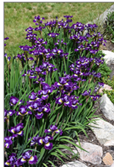
Jewelled Crown Siberian Iris in bloom

BRUNSWICK 422 Bath Road Brunswick, ME 04011 1-800-339-8111 207-442-8111