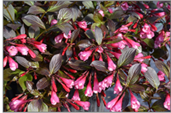
Very Fine Wine Weigela flowers

CUMBERLAND 201 Gray Rd (Route 100) Cumberland, ME 04021 1-800-348-8498 207-829-5619