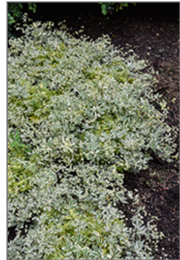
Golden Feathers Jacob's Ladder foliage

Golden Feathers Jacob's Ladder is recommended for the following landscape applications;