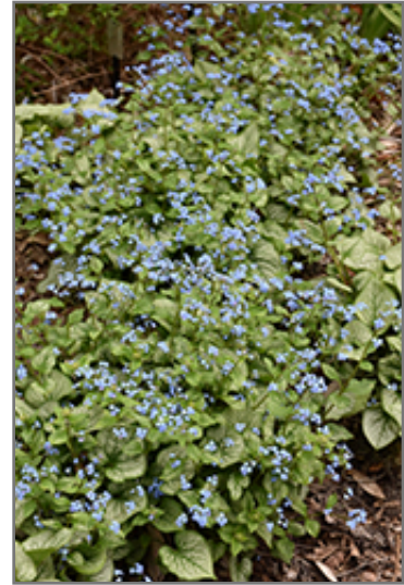
Jack Frost Bugloss in bloom

Jack Frost Bugloss is a fine choice for the garden, but it is also a good selection for planting in outdoor pots and containers. It is often used as a 'filler' in the 'spiller-thriller-filler' container combination, providing a mass of flowers and foliage against which the thriller plants stand out. Note that when growing plants in outdoor containers and baskets, they may require more frequent waterings than they would in the yard or garden.