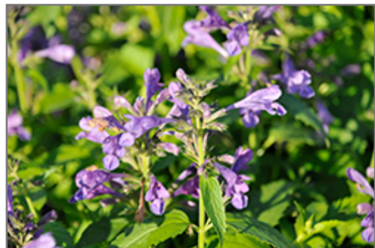
Prelude Purple Catmint flowers

BRUNSWICK 422 Bath Road Brunswick, ME 04011 1-800-339-8111 207-442-8111