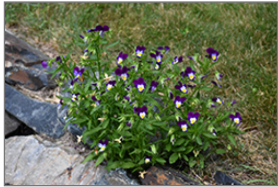
Johnny Jump-Up in bloom

Johnny Jump-Up will grow to be only 4 inches tall at maturity extending to 6 inches tall with the flowers, with a spread of 6 inches. When grown in masses or used as a bedding plant, individual plants should be spaced approximately 5 inches apart. It grows at a fast rate, and tends to be biennial, meaning that it puts on vegetative growth the first year, flowers the second, and then dies. However, this species tends to self-seed and will thereby endure for years in the garden if allowed. As an herbaceous perennial, this plant will usually die back to the crown each winter, and will regrow from the base each spring. Be careful not to disturb the crown in late winter when it may not be readily seen!