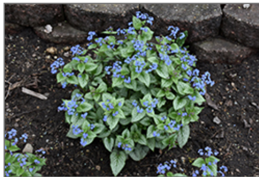
Sterling Silver Bugloss in bloom

BRUNSWICK 422 Bath Road Brunswick, ME 04011 1-800-339-8111 207-442-8111