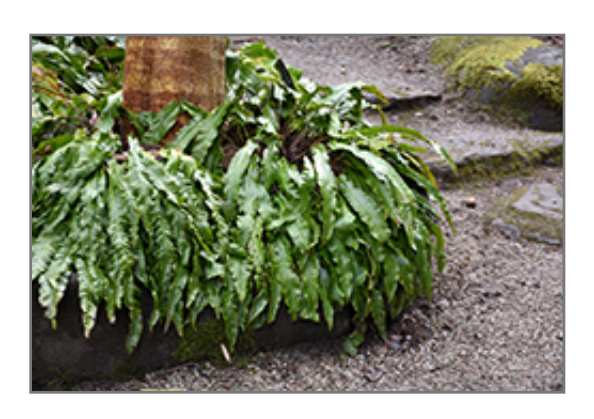
Hart's Tongue Fern

This variety is unusual in that it has simple, undivided fronds that are up to 2 feet long; yellowish and stunted in full sun; luxurious green foliage is a welcome addition to the garden as a groundcover