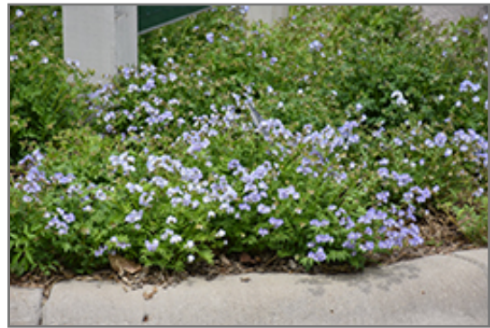
Creeping Jacob's Ladder in bloom

BRUNSWICK 422 Bath Road Brunswick, ME 04011 1-800-339-8111 207-442-8111