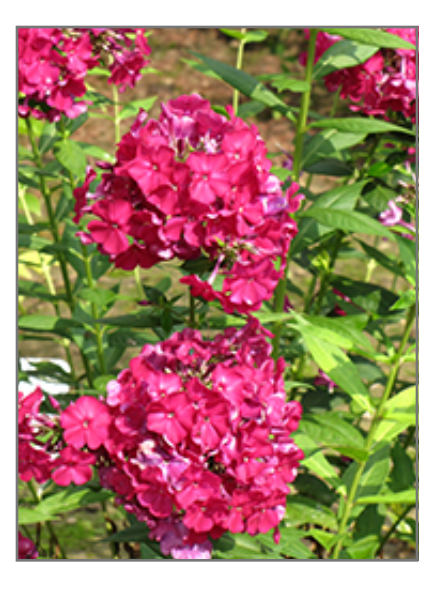
Nicky Garden Phlox flowers

Nicky Garden Phlox features bold fragrant conical hot pink star-shaped flowers at the ends of the stems from early summer to early fall. The flowers are excellent for cutting. Its narrow leaves remain green in color throughout the season.