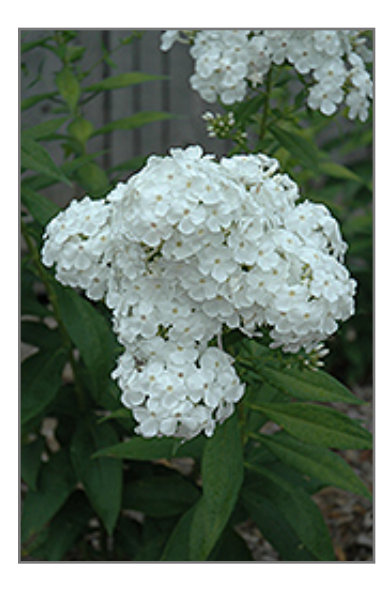
David Garden Phlox flowers