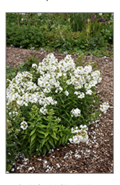
David Garden Phlox in bloom