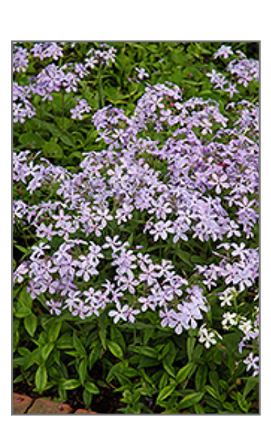
Woodland Phlox flowers

CUMBERLAND 201 Gray Rd (Route 100) Cumberland, ME 04021 1-800-348-8498 207-829-5619