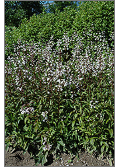
Husker Red Beard Tongue in bloom

Husker Red Beard Tongue is a fine choice for the garden, but it is also a good selection for planting in outdoor pots and containers. With its upright habit of growth, it is best suited for use as a 'thriller' in the 'spiller-thriller-filler' container combination; plant it near the center of the pot, surrounded by smaller plants and those that spill over the edges. Note that when growing plants in outdoor containers and baskets, they may require more frequent waterings than they would in the yard or garden.