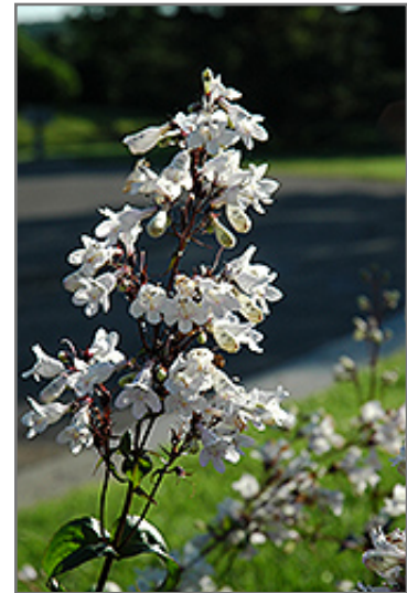
Husker Red Beard Tongue flowers