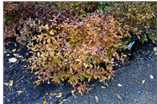
Bowman's Root in fall

BRUNSWICK 422 Bath Road Brunswick, ME 04011 1-800-339-8111 207-442-8111