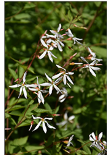
Bowman's Root flowers

This plant will require occasional maintenance and upkeep, and should be cut back in late fall in preparation for winter. It is a good choice for attracting bees and butterflies to your yard. It has no significant negative characteristics.