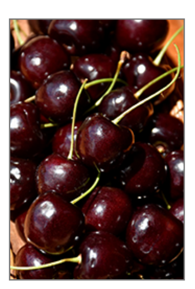
Lapins Cherry fruit

Lapins Cherry is draped in stunning clusters of fragrant white flowers hanging below the branches in early spring before the leaves. It has dark green deciduous foliage. The pointy leaves turn yellow in fall. The fruits are showy red drupes which fade to black over time, which are carried in abundance in early summer. The fruit can be messy if allowed to drop on the lawn or walkways, and may require occasional clean-up. The smooth dark red bark adds an interesting dimension to the landscape.