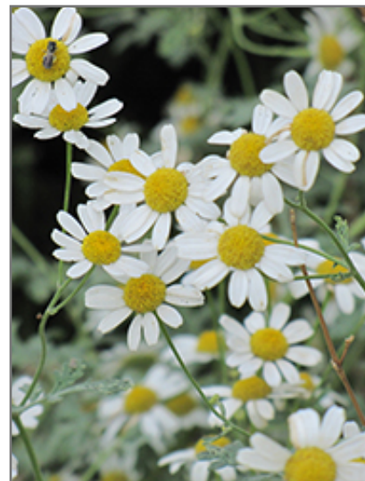
German Chamomile flowers

BRUNSWICK 422 Bath Road Brunswick, ME 04011 1-800-339-8111 207-442-8111