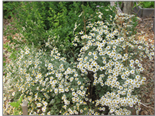
German Chamomile

This plant is quite ornamental as well as edible, and is as much at home in a landscape or flower garden as it is in a designated herb garden. It does best in full sun to partial shade. It is very adaptable to both dry and moist locations, and should do just fine under typical garden conditions. It is not particular as to soil type or pH. It is somewhat tolerant of urban pollution. This species is not originally from North America.