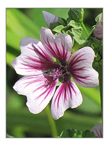
Zebrina Mallow flowers