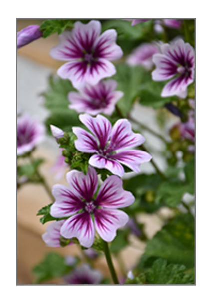
Zebrina Mallow flowers