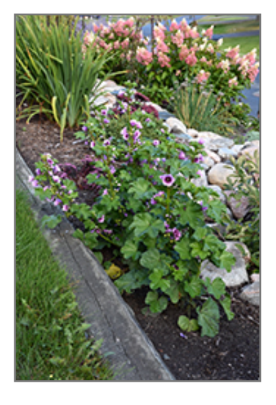
Zebrina Mallow in bloom

This plant should only be grown in full sunlight. It does best in average to evenly moist conditions, but will not tolerate standing water. It is not particular as to soil type or pH. It is highly tolerant of urban pollution and will even thrive in inner city environments. Consider applying a thick mulch around the root zone in winter to protect it in exposed locations or colder microclimates. This is a selected variety of a species not originally from North America.