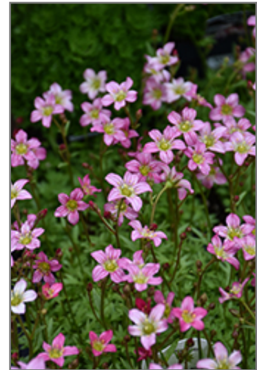
Touran Pink Saxifrage flowers

Touran Pink Saxifrage is recommended for the following landscape applications;